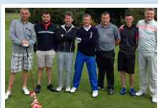
Kindred Cup Team