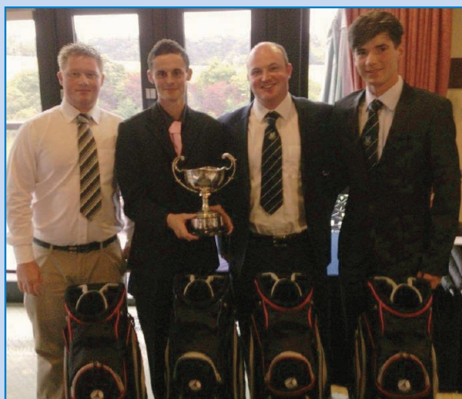
The team with the trophy and their prizes