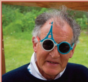
Irv the tourist

Following the prize-giving, Kit Neilson and Eddie Laine conducted a superb fines session, delighting everybody whilst relieving most of them of their few remaining Euros. In fact, we learn from the Captain, that these Euros were not so few in number as the takings from this session amounted to a very impressive €200. Add to this the entirely voluntary